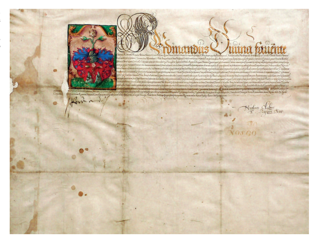
148. Bernát Zichy's letters patent. Pozsony, February 1st, 1550

The ascenders of the letter "D" expand into a pattern of flourishes that merges into strapwork. Another letter type in the first line is a classical Roman capital, also written in gold. The spaces between these letters, like the interiors of the initials, are filled with minutely detailed foliate ornamentation, the red of which acts as a counterpoint to the color of the letters. Each of the words in the first line ends with a tiny piece of golden strapwork which mimics the line work of the initials. This first line is thus exquisitely executed, although the patterning of the two initials is significantly different from Bocskay's earlier Fraktur initials, and thus the calligraphic decoration of this letters patent may be the work of another, unknown master.