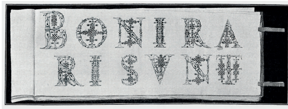
Fig. 64. Aus dem Schriftmusterbuch des Georg Bocskay. (Wien, Hofmuseum.)

Manuscript 2 was also reproduced in a facsimile edition in the mid-19<sup>th</sup> century, and though the aforementioned Sacken and Schlager were aware that Bocskay's work was reproduced in this publication, it did not mention the calligrapher's name, nor the fact that Manuscript 2 had served as one of its sources. This album, entitled Zier-Schrift nach Vorlagen aus dem sechszehnten Jahrhundert (Decorative Scripts Based on 16<sup>th</sup>-Century Models), was published by the Hof- und Staatsdruckerei in Vienna in 1850. We do not know the identity of its editor; it was likely produced in a tiny print run. The dimensions of this representative album were fairly large (roughly 55 \times 37 cm); it consisted of 15 pages of black-and-white lithographs featuring five alphabets ornamented in various styles. Of the five, two were derived from Bocskay's Manuscript 2 (fig. 2; cf. figs. 65–67 and 127). Given that the latter did not contain complete alphabets, all of Bocskay's letters were copied precisely for this album, with imitations in place of missing letters.