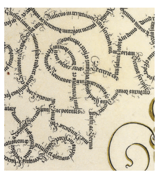
Bocskay's signature in the labyrinth in Manuscript 1 (details from fol. 118r)